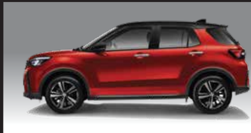
Differences from H