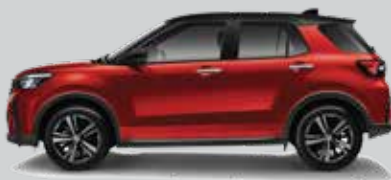
Pearl Delima Red*

Only the main differences between variants are listed here. For a list of features common to all variants, please consult a Perodua sales advisor.