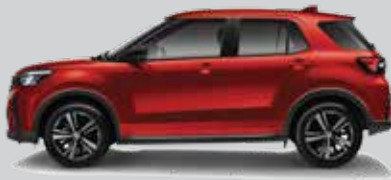
Pearl Delima Red**