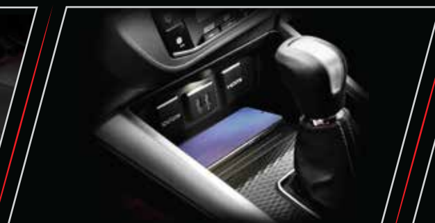
Open Tray with Illumination