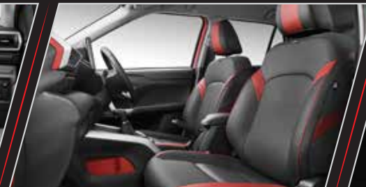
Semi-bucket Leather Seats