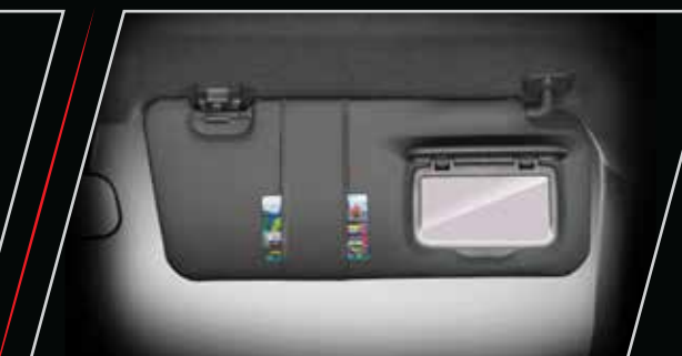
Vanity Mirror with Card Slot