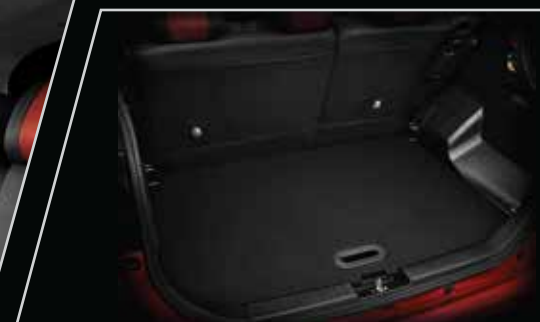
Tier 1: 303 litres