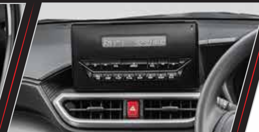
11" Radio with Bluetooth & MP3