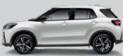
Pearl Diamond White**