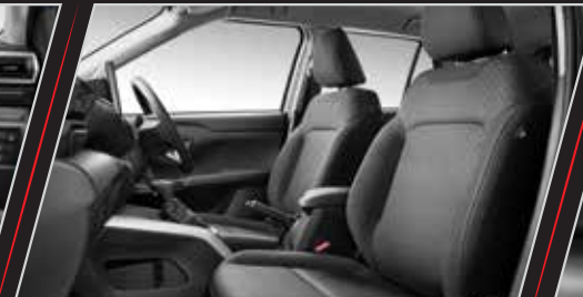
Semi-bucket Fabric Seats