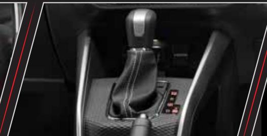
Gear Knob with Chrome