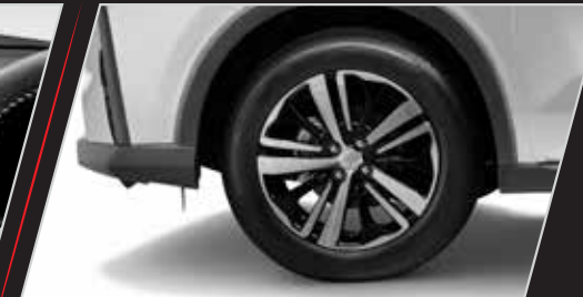
17-inch Alloy Wheels (5-spoke)