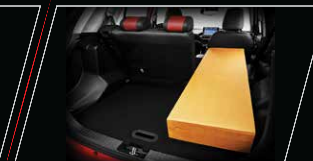
60:40 Split-folding Rear Seats