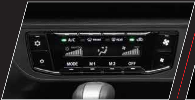
Digital air conditioner controller with quick OFF button