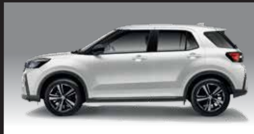
Differences from X