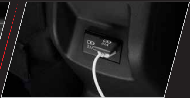
Rear USB ports*