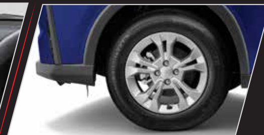
16-inch Alloy Wheels (5-spoke)