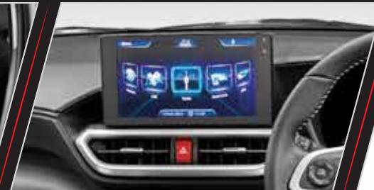
9" Display with sleek user interface