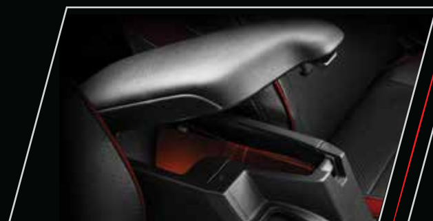
Console Box with Padded Armrest*