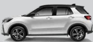
Pearl Diamond White*