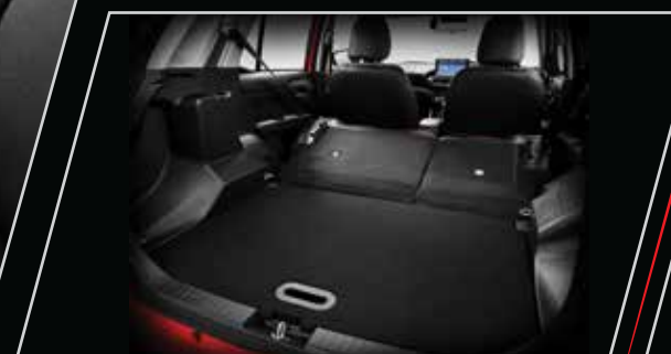
Full-flat Mode Rear Seats