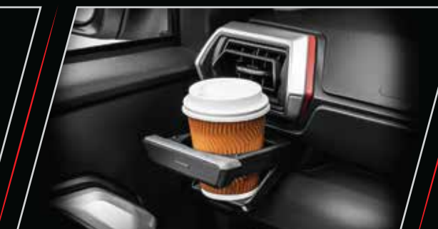
Built-in Cup Holder