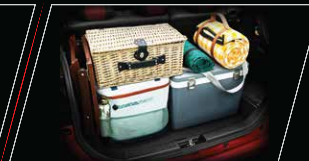
Tier 2: 369 litres